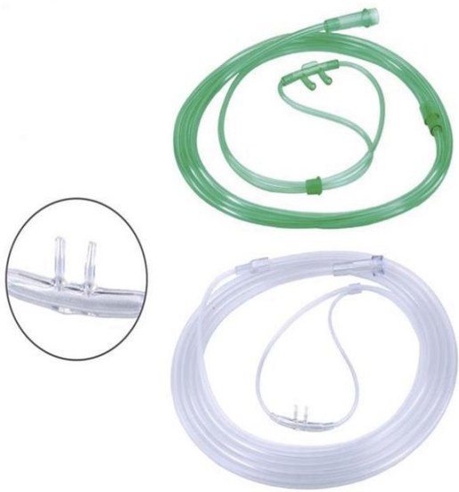
CANULA DE OXIGENO