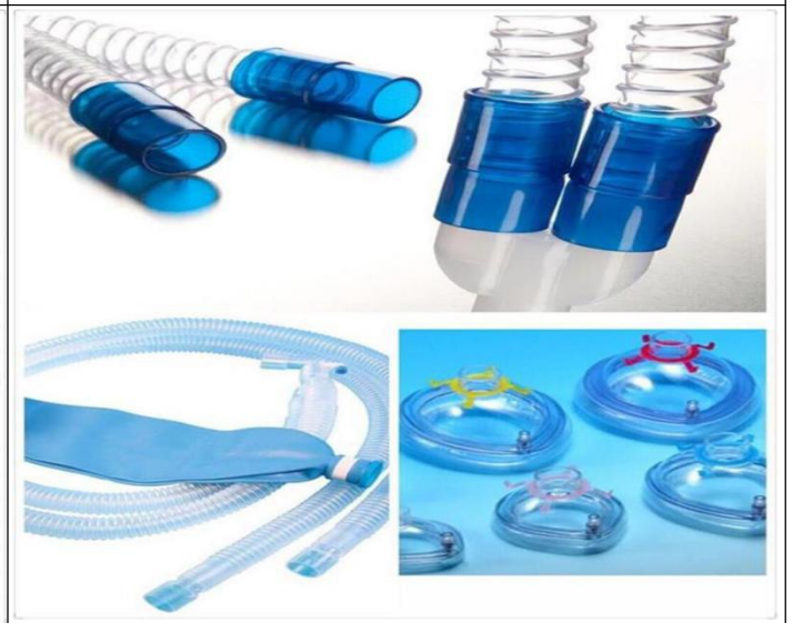
MASCARILLA Y VENTILADOR