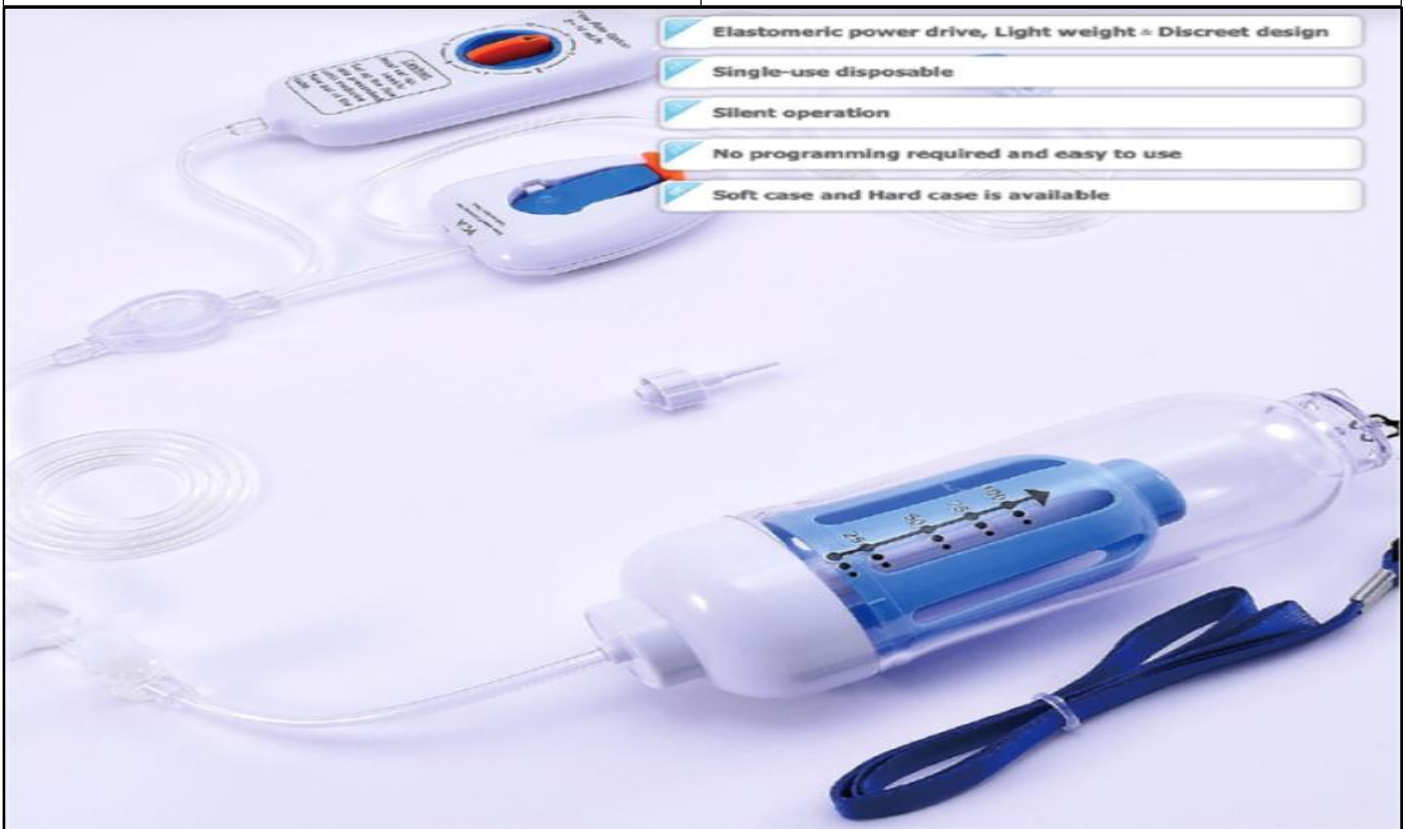
BAMBA INFUSION PCA DESECHABLE