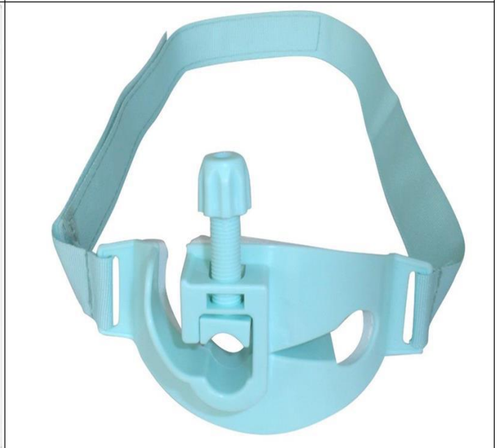
FIJADOR DE INTUBACION TRAQUEAL