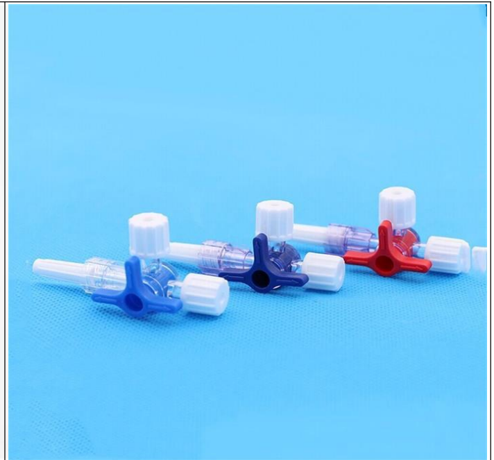
LLAVE DE 3 VIAS