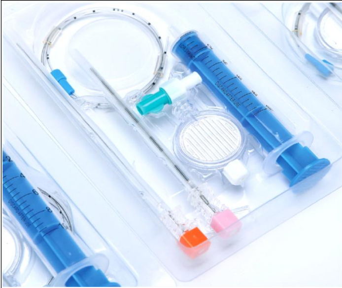
KIT AGUJA EPITURAL